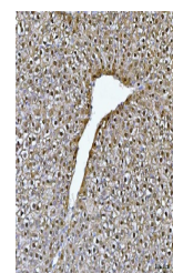
IHC analysis of FAA/FAH using anti-FAA/F...