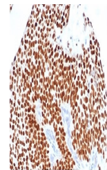
IHC staining of FFPE human bladder carci...