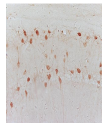
IHC-P of mouse hippocampus tissue (orb11...