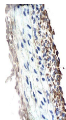
Immunohistochemical analysis of paraffin...