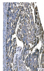
IHC analysis of NEDD4 using anti-NEDD4 a...