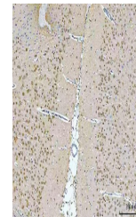
IHC analysis of NeuN/Rbfox3 using anti-NeuN...