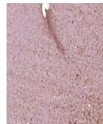
Immunohistochemical staining of Mouse li...