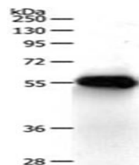
Western blot analysis of Gel: 10%SDS-PAG...