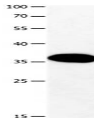
Western blot analysis of Gel: 10%SDS-PAG...