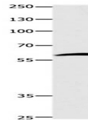
Western blot analysis of Gel: 8%SDS-PAGE...