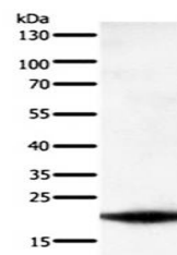
Western blot analysis of Gel: 12%SDS-PAG...