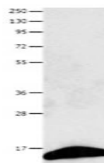
Western blot analysis of Gel: 10%SDS-PAG...