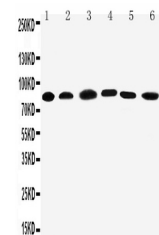
Western blot analysis of PC1/3/PCSK1 using anti-PC...