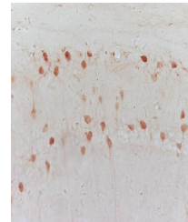
IHC-Fr of mouse brain tissue (1:200 dilu...