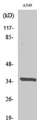
Western Blot analysis of various cells using Peroxin 2 Polyclonal Antibody

This gene encodes an integral peroxisomal membrane protein required for peroxisome biogenesis. The protein is thought to be involved in peroxisomal matrix protein import. Mutations in this gene result in one form of Zellweger syndrome and infantile Refsum disease. Alternative splicing results in multiple transcript variants encoding the same protein. [provided by RefSeq, Jul 2008],