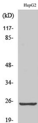
Western Blot analysis of various cells using HRF Polyclonal Antibody

function:Involved in calcium binding and microtubule stabilization.,similarity:Belongs to the TCTP family.,subunit:Interacts with STEAP3.,tissue specificity:Found in several healthy and tumoral cells including erythrocytes, hepatocytes, macrophages, platelets, keratinocytes, erythroleukemia cells, gliomas, melanomas, hepatoblastomas, and lymphomas. It cannot be detected in kidney and renal cell carcinoma (RCC). Expressed in placenta and prostate.,