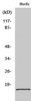
Western Blot analysis of various cells using eIF5A2 Polyclonal Antibody diluted at 1:1000

function: The precise role of eIF-5A in protein biosynthesis is not known but it functions by promoting the formation of the first peptide bond., PTM: eIF-5A seems to be the only eukaryotic protein to have an hypusine residue which is a post-translational modification of a lysine by the addition of a butylamino group (from spermidine)., similarity: Belongs to the eIF-5A family., tissue specificity: Expressed in ovarian and colorectal cancer cell lines (at protein level). Highly expressed in testis. Overexpressed in some cancer cells.,