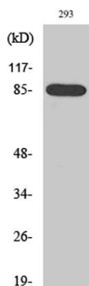
Western Blot analysis of various cells using BRSK1 Polyclonal Antibody

catalytic activity:ATP + a protein = ADP + a phosphoprotein.,cofactor:Magnesium.,enzyme regulation:Activated by phosphorylation on Thr-205 by STK11 in complex with STE20-related adapter-alpha (STRAD alpha) pseudo kinase and CAB39.,function:Required for the polarization of forebrain neurons which endows axons and dendrites with distinct properties, possibly by locally regulating phosphorylation of microtubule-associated proteins (By similarity). May be involved in the regulation of G2/M arrest in response to UV- or methyl methane sulfonate (MMS)-induced, but not IR-induced, DNA damage. Phosphorylates WEE1 and CDC25B in vitro and CDC25C in vitro and in vivo.,similarity:Belongs to the protein kinase superfamily. CAMK Ser/Thr protein kinase family. AMPK subfamily.,similarity:Contains 1 protein kinase domain.,similarity:Contains 1 UBA domain.,subcellular location:Nuclear in the absence of DNA damage. Translocated to the nucleus in response to UV- or MMS-induced DNA damage.,tissue specificity:Widely expressed, with highest levels in brain and testis. Protein levels remain constant throughout the cell cycle.,