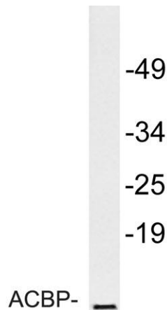
Western blot analysis of lysate from HuvEc cells, using ACBP antibody.